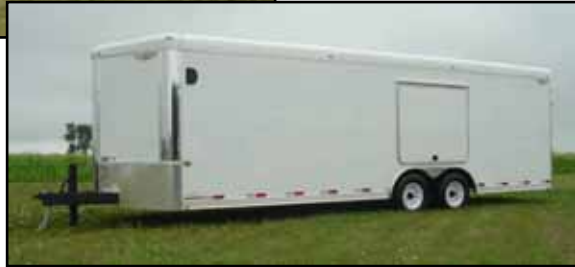
Model shown above with optional V-Nose and fender door.