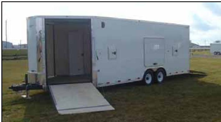
Model shown above with optional Sled Nose with ramp door, fuel doors, and fender door.