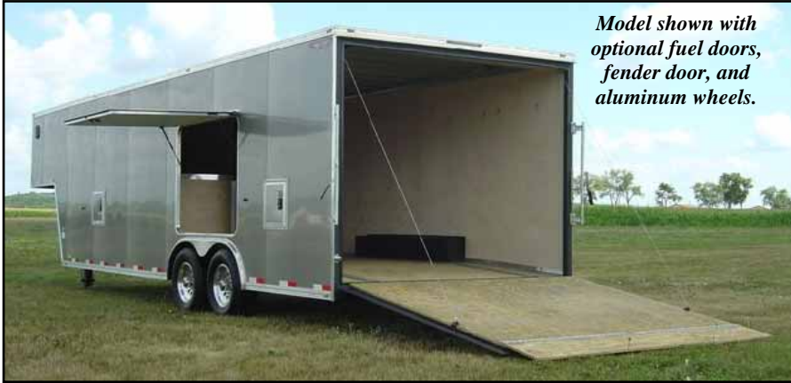
Model shown with optional fuel doors, fender door, and aluminum wheels.

All the standard features of our CR Series car carrier with 82" of head room and a sleek flattop roof design.