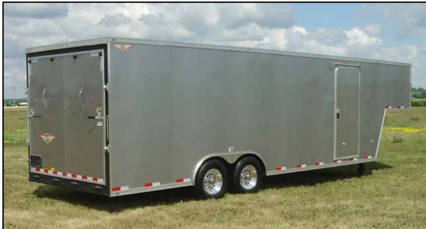
Model shown above with optional aluminum wheels.