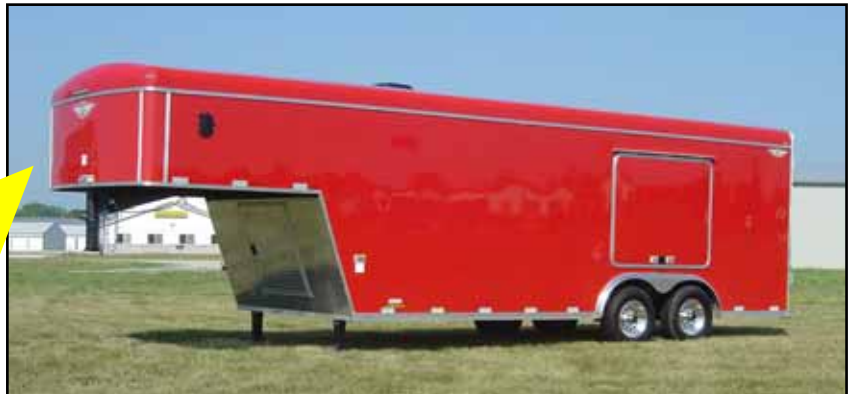
Model shown above with optional color, roof vent, fender door, aluminum wheels, & 9990lb GVWR package.