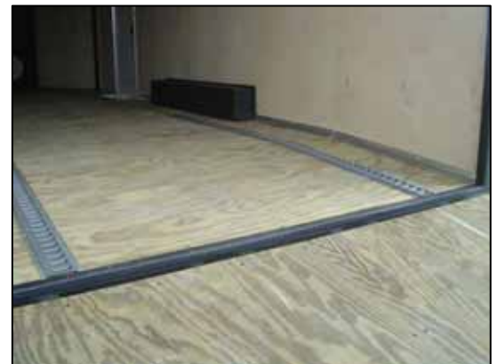
Standard dovetail in car carrier models.

Same available options as our standard CR Series Car Carrier. See our custom options section!!