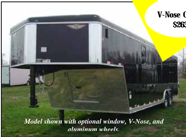
Model shown with optional window, V-Nose, and aluminum wheels.