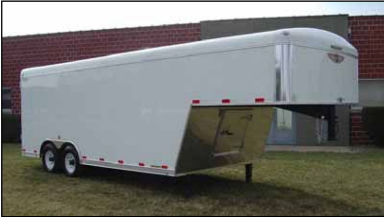
Model shown with optional removal of side escape door.