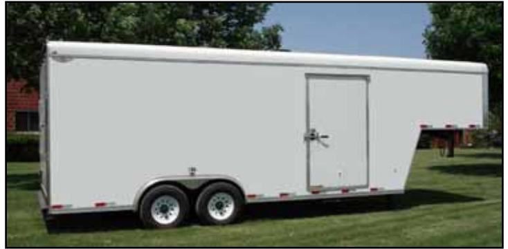
Model shown above with optional 48" door upgrade and heavy suspension package.

Fully Enclosed Gooseneck Body with lockable storage built in!