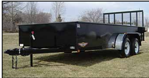
Model shown with optional 24" sides.