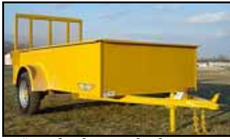
15" steel sides standard...optional 24" or 34" side available!