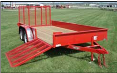
Optional landscape gate shown.