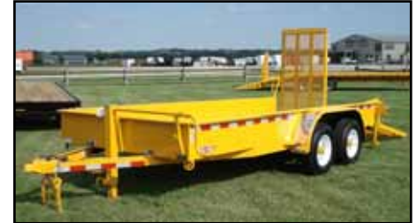
Model shown with optional split ramp gate, 9990lb suspension, and color.