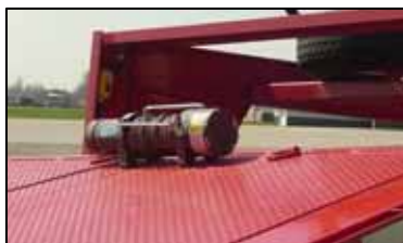
9000lb electric winch mounted on SpeedLoader EX Gooseneck Optional diamond plate steel floor and deck extensions shown

WARNING: H&H DOES NOT RECOMMEND TILTING THE SPEEDLOADER ® BED WHEN THE TRAILER IS NOT COUPLED TO THE TOW VEHICLE.