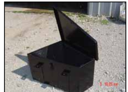
Tongue mounted toolbox for MX and EX SpeedLoader models.

Prices and specifications can and WILL change without notice.