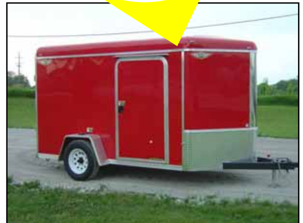
All of the excellent standard features of our single axle cargos with extra length in an Aerodynamic V-Nose

All items listed are standard production options. If you wish for special features, dimensions, or components, call us! Our 25,000 square foot custom facility can quote any job large or small.